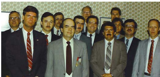
Camp members at Camp #1250's Charter Dinner Meeting at the Stagecoach Inn in Salado on April 29, 1989. The Camp received its charter at the meeting.