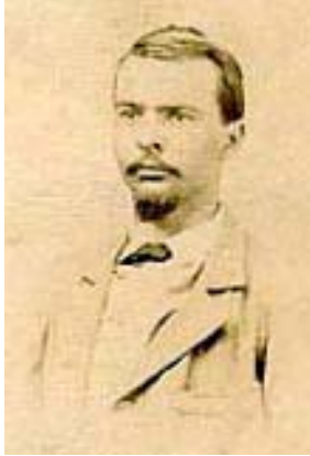
Joseph Draper Sayers

Sayers was part of Sibley's force in New Mexico