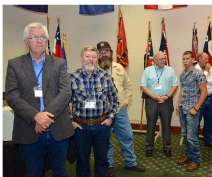
Camp members at 2013 Texas Division Reunion