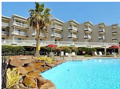
Hawthorn Suites/Victorian Resort and Conference Center in Galveston, site of the 2008 Texas Division