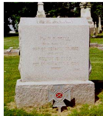
William Beall's grave at Mount Olivet Cemetery in Nashville, Tennessee

buried in Mt. Olivet Cemetery in Nashville, Tennessee.