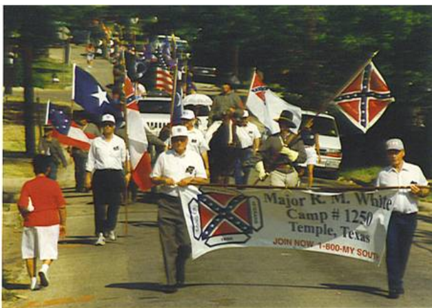
Camp Members March in Belton Parade in 1997.

121 at Crusader Way (also known as University Drive).